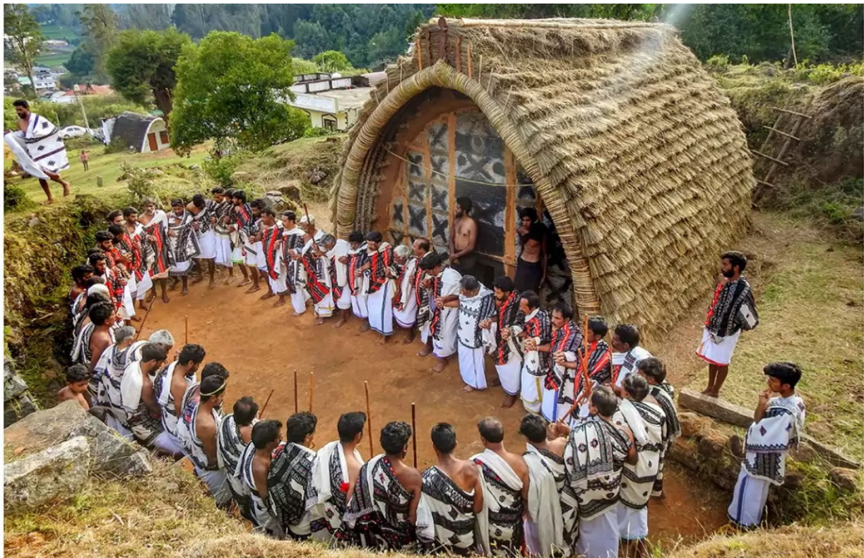
Tribals Forced To Do 'Dandavat Parikrama': NCST Launches Probe, Issues Notice To West Bengal Police Representational Image