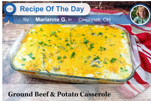
Ground Beef & Potato Casserole