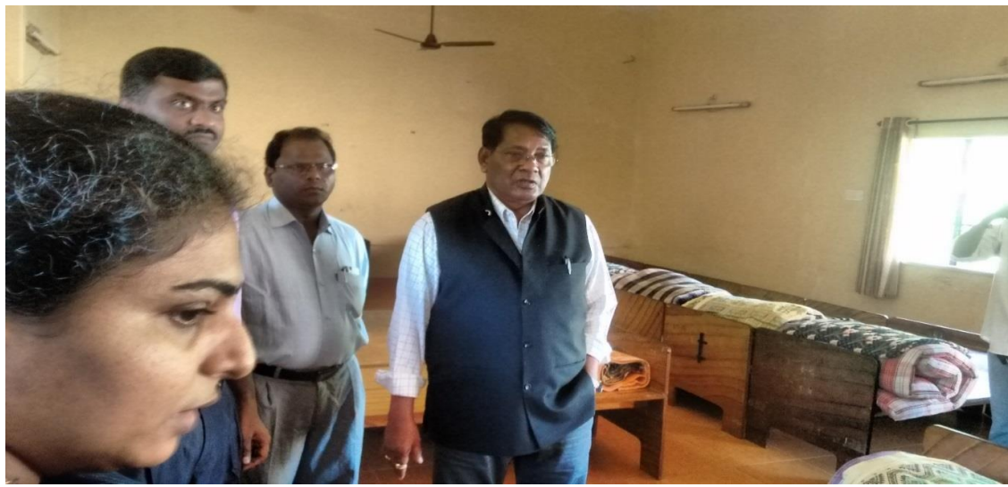
Dr. Rameshwar Oraon, Hon'ble Chairperson, NCST inspecting the hostel

H23 The Commission visited Madhya Padhav Ashram School in Dakshin Kannada district and observed that the kitchen of the Ashram School was neat and clean, diet chart was maintained and students were being served food according to the diet chart. There were no chairs and tables in the dining hall and the students used to take their meals sitting on the floor. The Commission advised the concerned authorities to make arrangement of chairs and tables in the dining hall of the Ashram School.