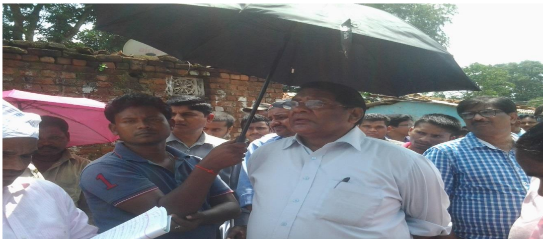
एच.ई.सी.एल. विस्थापित नया सराय के ग्रामवासियों से चर्चा करते हुए डॉ. रामेश्वर उरांव, अध्यक्ष, रा ट्रीय अनुसूचित जनजाति आयोग, नई दिल्ली।