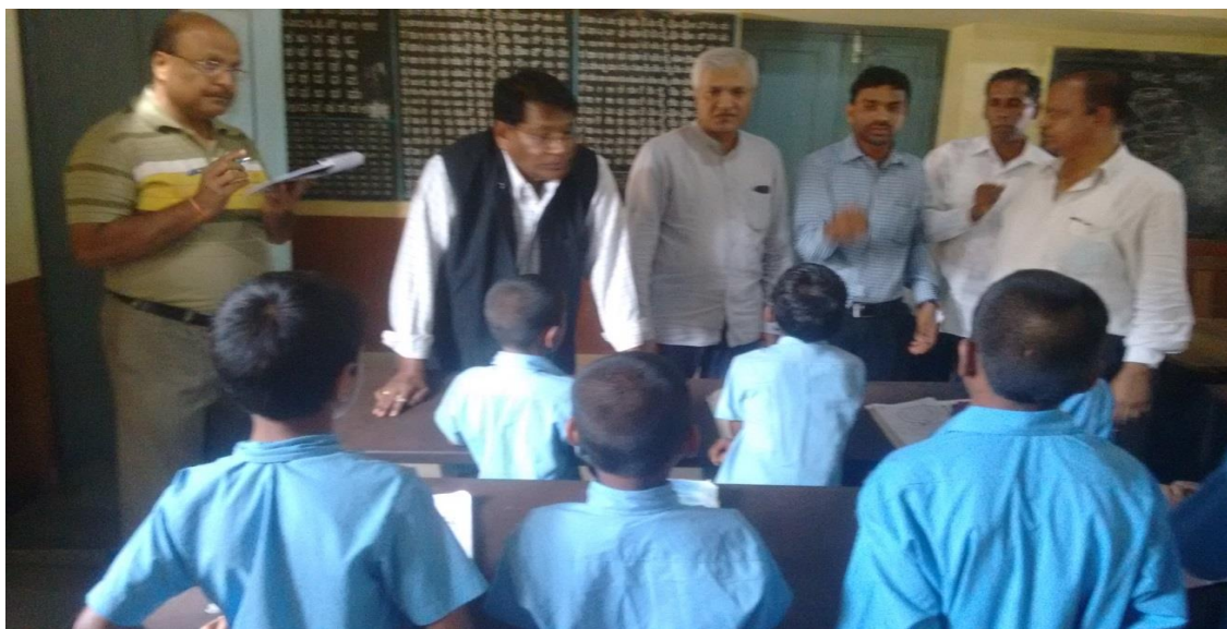
Dr.Rameshwar Oraon, Hon'ble Chairperson, NCST having discussion with tribal students

H18 Commission was informed that this Ashram School was started in the year 1992 and students of class 1 st to 5 th have been admitted in the Ashram School. Presently, the strength of Ashram School is for accommodating 104 students out of which 89 students belongs to ST Community. There are 58 boys and 31 girls of ST Community staying in the Ashram School. It was informed that after passing out class 5, the students take admission in Morarji Desai Residential school and other nearby schools. It was also informed that some students of this Ashram School have completed graduation and some others have completed their ITI and are working in software industry in Bengaluru. 3 girls have completed nursing course and are working in private institutions. The Commission was informed that health check-up of students is conducted regularly in the school and a diet chart has been prepared to provide nutritious meal to the students. There are 5 staff members working in the kitchen and for providing safe drinking water, aquagaurd has also been installed. During rainy season, the students are provided boiled water for safe consumption. There is solar power provided in the Ashram School. An amount of Rs. 1100 per student per month was provided to the Ashram School. Uniforms, Textbooks and notebooks are also provided to them.