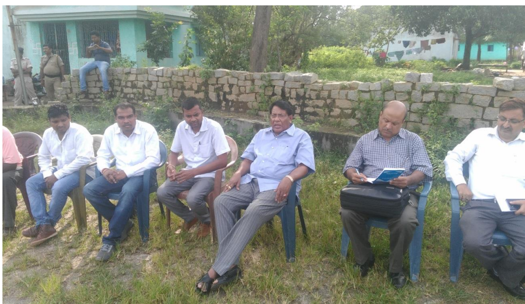
एच.ई.सी.एल. विस्थापित नचियातु के ग्रामवासियों से चर्चा करते हुए डॉ. रामेश्वर उरांव, अध्यक्ष, रा ट्रीय अनुसूचित जनजाति आयोग, नई दिल्ली।

J3 विस्थापित ग्रामवासियों ने आयोग को निम्नलिखित जानकारियां दी और समस्याओं से अवगत कराया:—