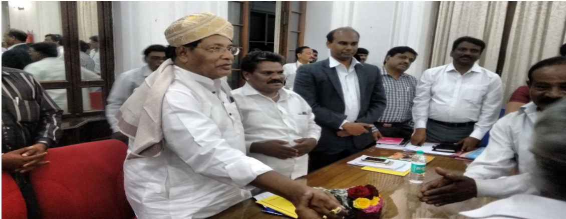
Dr.Rameshwar Oraon, Hon'ble Chairperson, NCST being welcomed by Deputy Commissioner, Mysuru

H88 The Commission held meeting with the Deputy Commissioner and other District level officers regarding various issues raised by the tribals during field visits. The brief of discussion and points for action are as under: