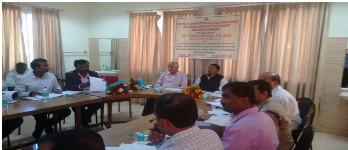
Dr.Rameshwar Oraon, Hon'ble Chairperson, NCST having discussion with Deputy Commissioner, Udupi at Mangalore

11) Some of the families were reportedly not provided pattas under Forest Rights Act. The eligible tribals should be provided Forest Rights Pattas and cases of rejected claims of tribals and OTFDs should be reviewed by him. It was advised that District authorities should take required steps /action and Commission may be informed of the same.