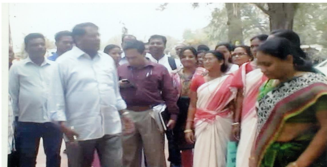
Field visit to the Resettlement Colony

F45 After completion of the meeting with the authorities of Rourkela Steel Plant, the Commission made field visit to the Resettlement colonies at Jolda village. Commission visited all the three Blocks of A.B & C. During visit it is noticed that the road condition is very poor. The inhabitants have not been provided with safe drinking water. The present electricity is not sufficient to cater the need of the Households. It was brought to the notice of the Commission that no land was earmarked for the tribals for %Sarna+ (place of worship) although lands have been allotted for other religious place for which they have been discriminated. Honϕle Chairman stated that the matter will be taken up with the District Administration as well as with the management of RSP. After completion of visit Honϕle Chairperson instructed the Additional District Magistrate, Rourkela to give focus about the basic amenities like safe drinking water, electricity, road etc.